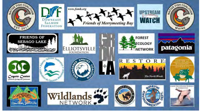
Organizations working to reinstate mandatory state-level listing of federally listed species. See page 6 for testimony highlights.